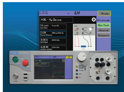
VITREK V10X HIPOT TESTER

The V10X serves as the measurement engine of the system, providing advanced hipot and electrical safety testing with a modern touchscreen interface, programmable test sequences, and integrated reporting tools. Its high-voltage performance and sensitive measurement capability allow manufacturers to verify dielectric withstand, leakage current, and insulation integrity with confidence across a wide range of cable products.